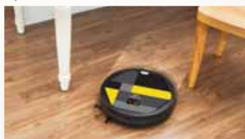
When running on standard 132 sqm. house. Depends on cleaning condition, the result may vary.

Using our highly efficient energy saving technology, iCLEBO POP can run up to 160 minutes, the longest running time among equivalent models.